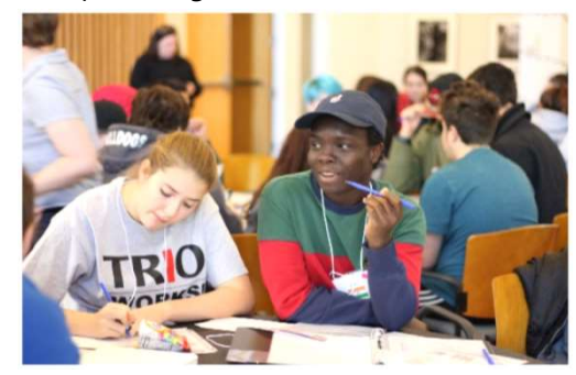
Evidence of acheivement

Over 1,200 colleges, universities, community colleges and agencies now offer TRIO Programs in the United States and territories. TRIO funds are distributed to institutions through competitive grants.