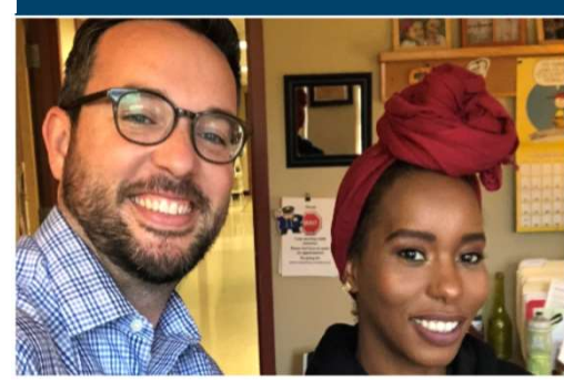
Who is served

As mandated by Congress, two-thirds of the students served must come from families with low incomes, and be first generation where neither parent graduated with a bachelors degree.